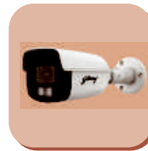
STE-FD20IR3.6P-1080P STE-FB20IR3.6P-1080P STE-FD20IR3.6P-1080PN STE-FB20IR3.6P-1080PNC