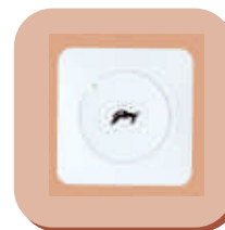
STE-FD20IR3.6P-1080PA STE-FB20IR3.6P-1080PA STE-UR8S1-1080P